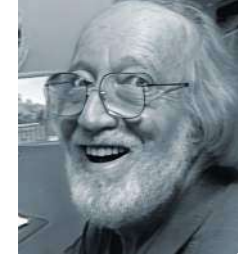
From top to bottom, José Leite Lopes, Marcos Moshinsky, and Juan José Giambiagi

Funding for CLAF comes from the annual contributions of its member countries, as well as from national or international agreements established by the institution.